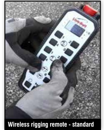
Wireless rigging remote - standard